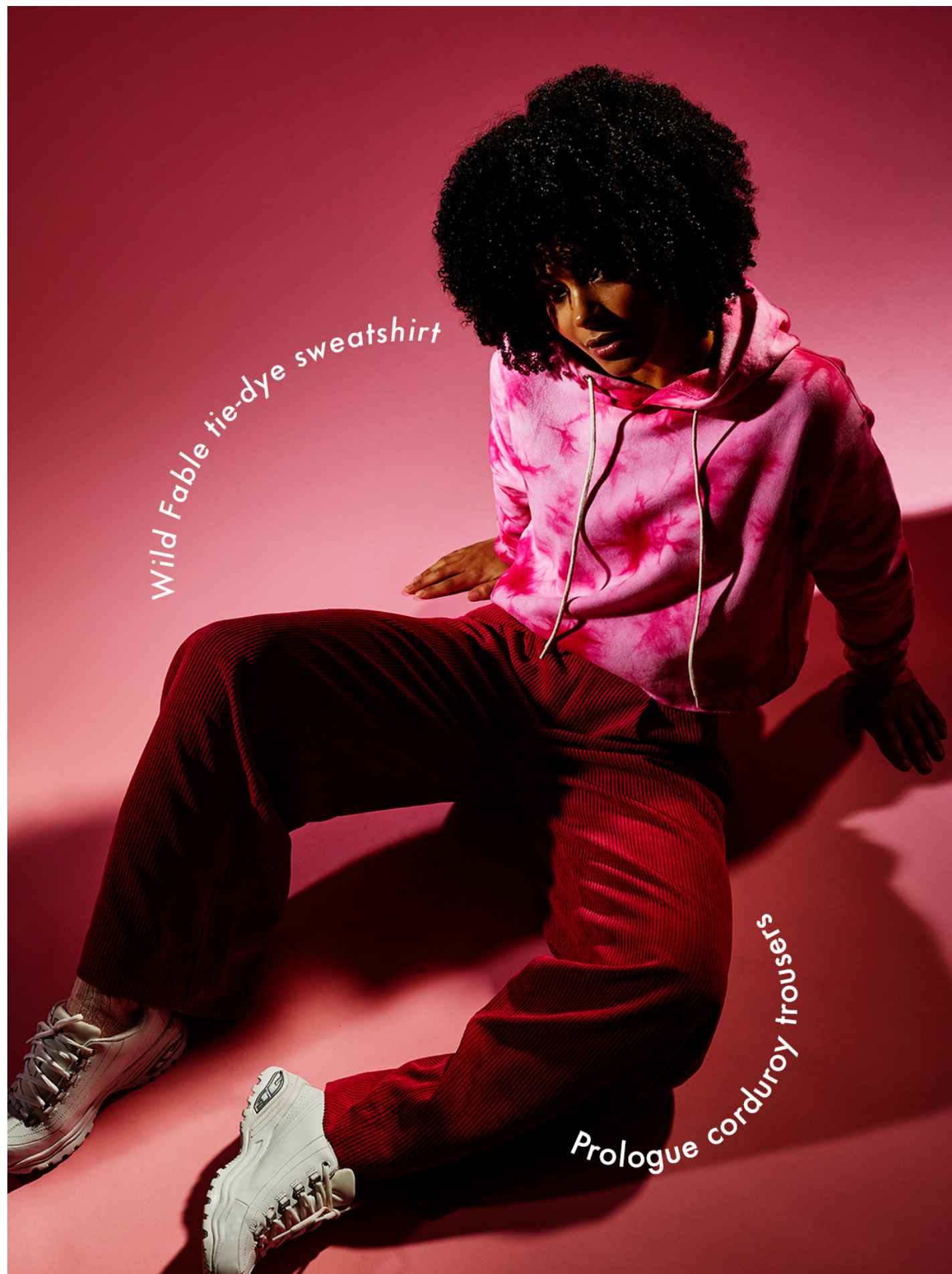
Wild Fable tie-dye sweatshirt