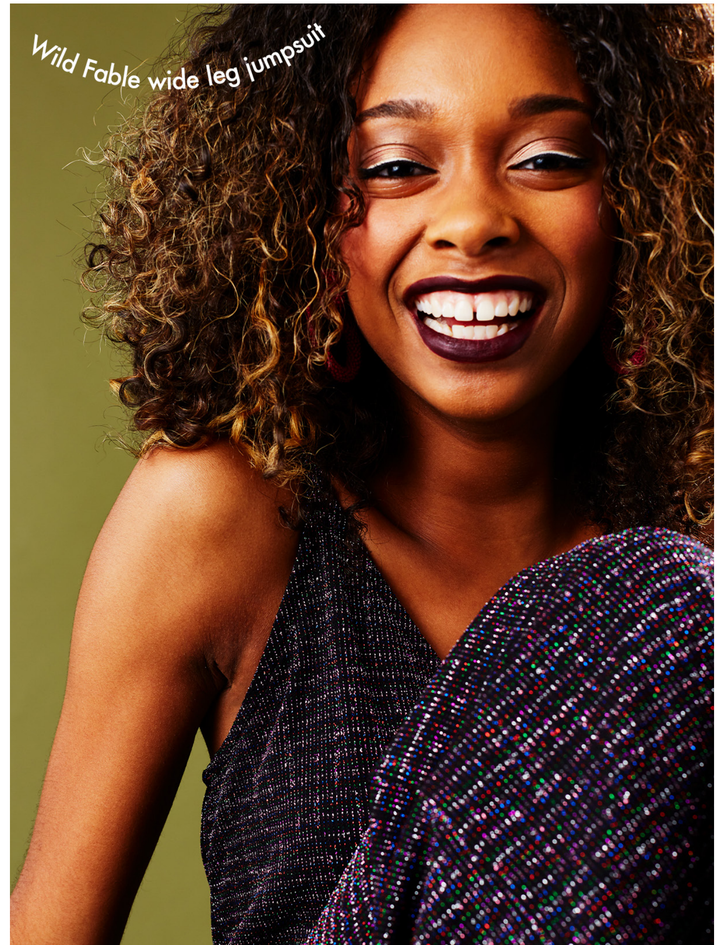
Wild Fable wide leg jumpsuit