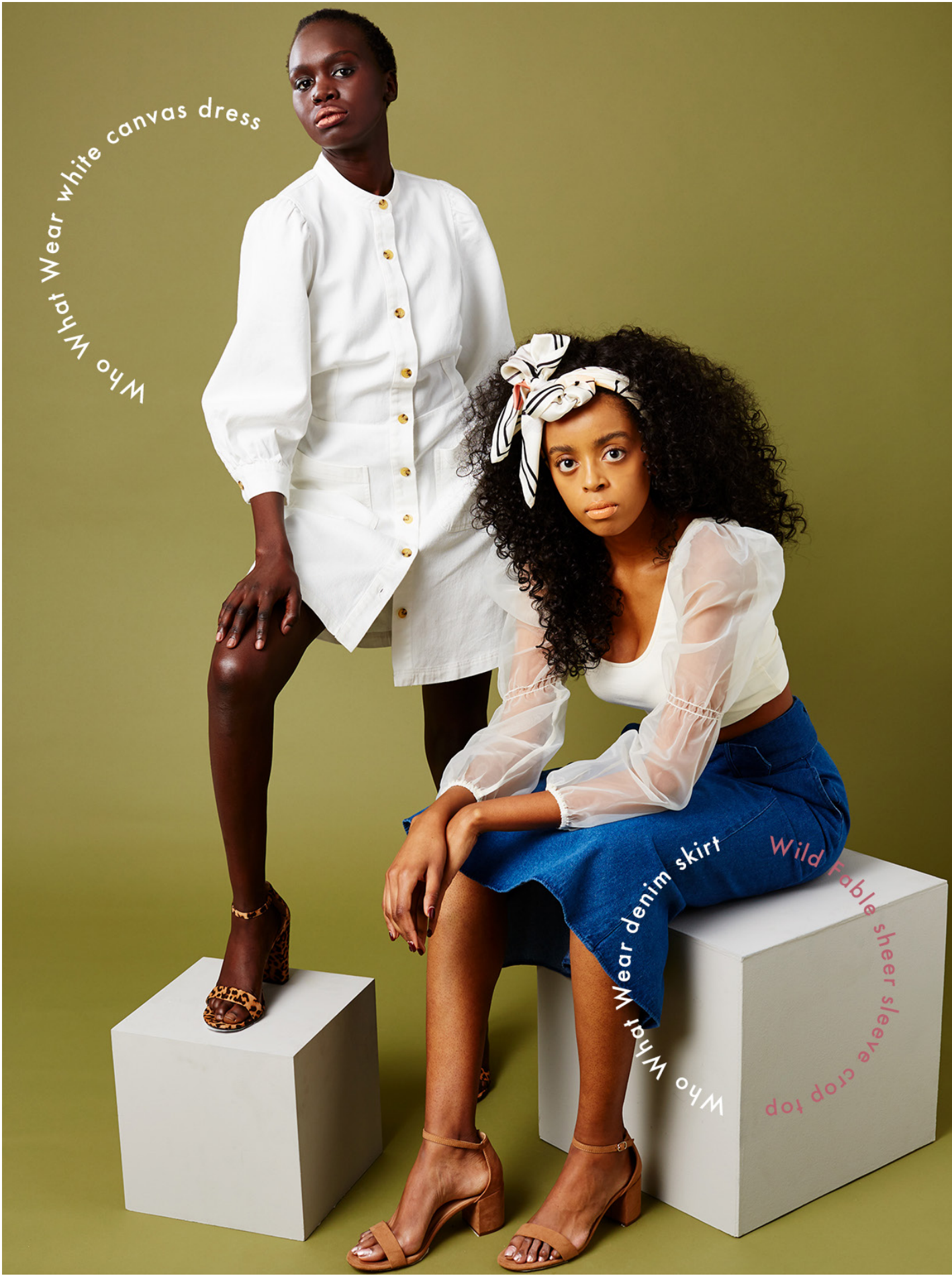
Who What Wear white canvas dress