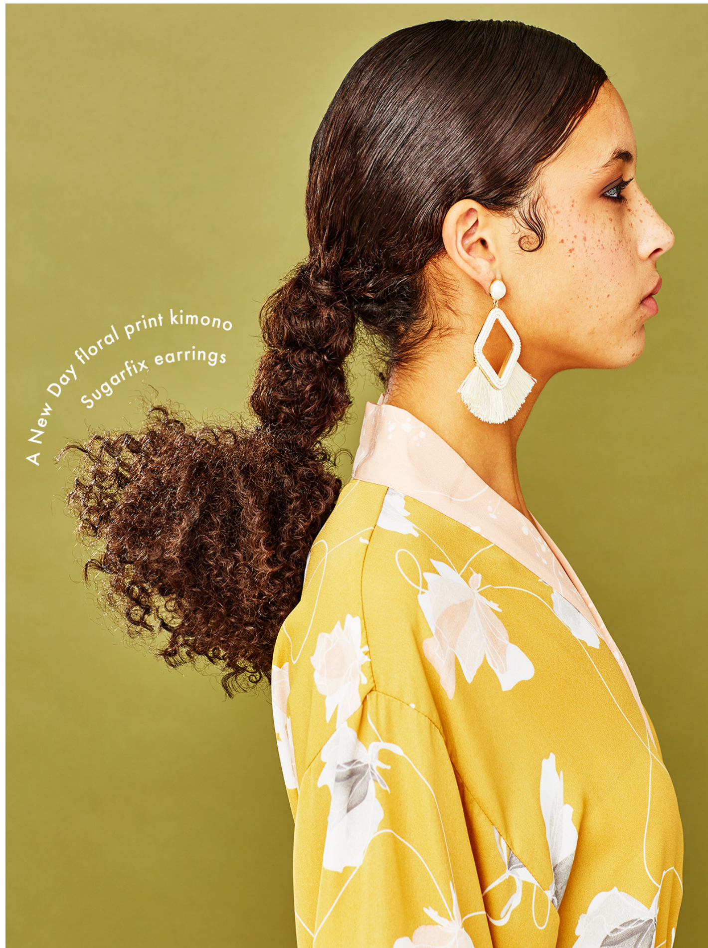
A New Day floral print kimono Sugarfix earrings