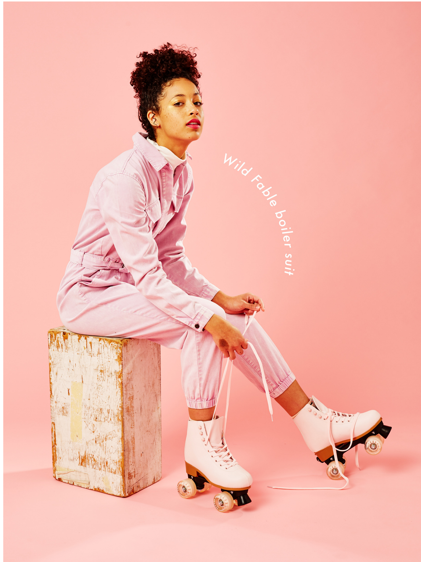
Wild Fable boiler suit