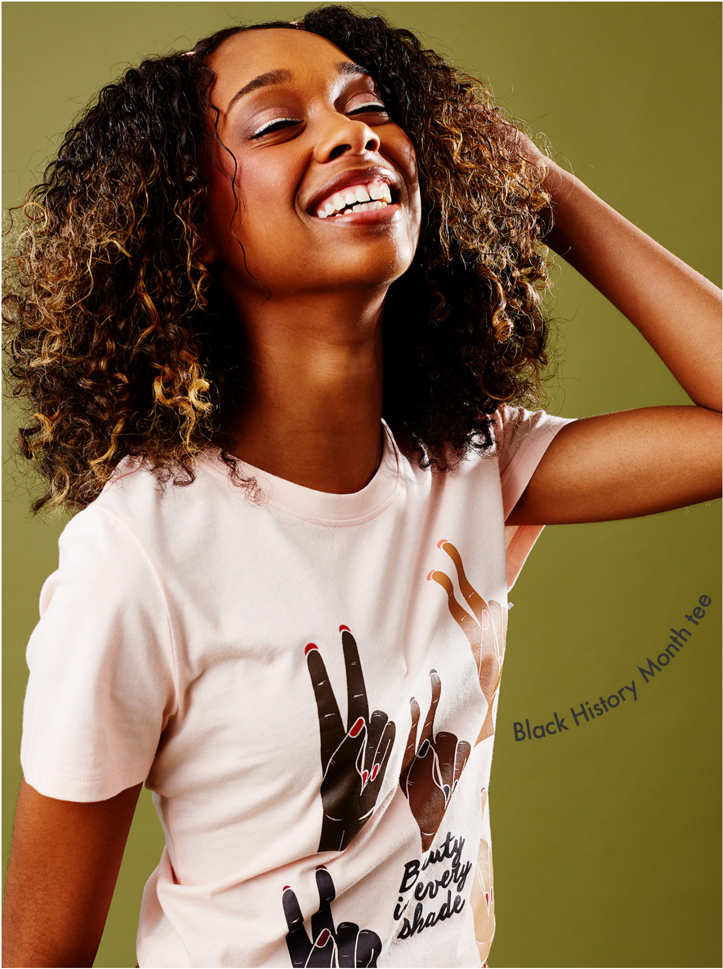
Black History Month tee