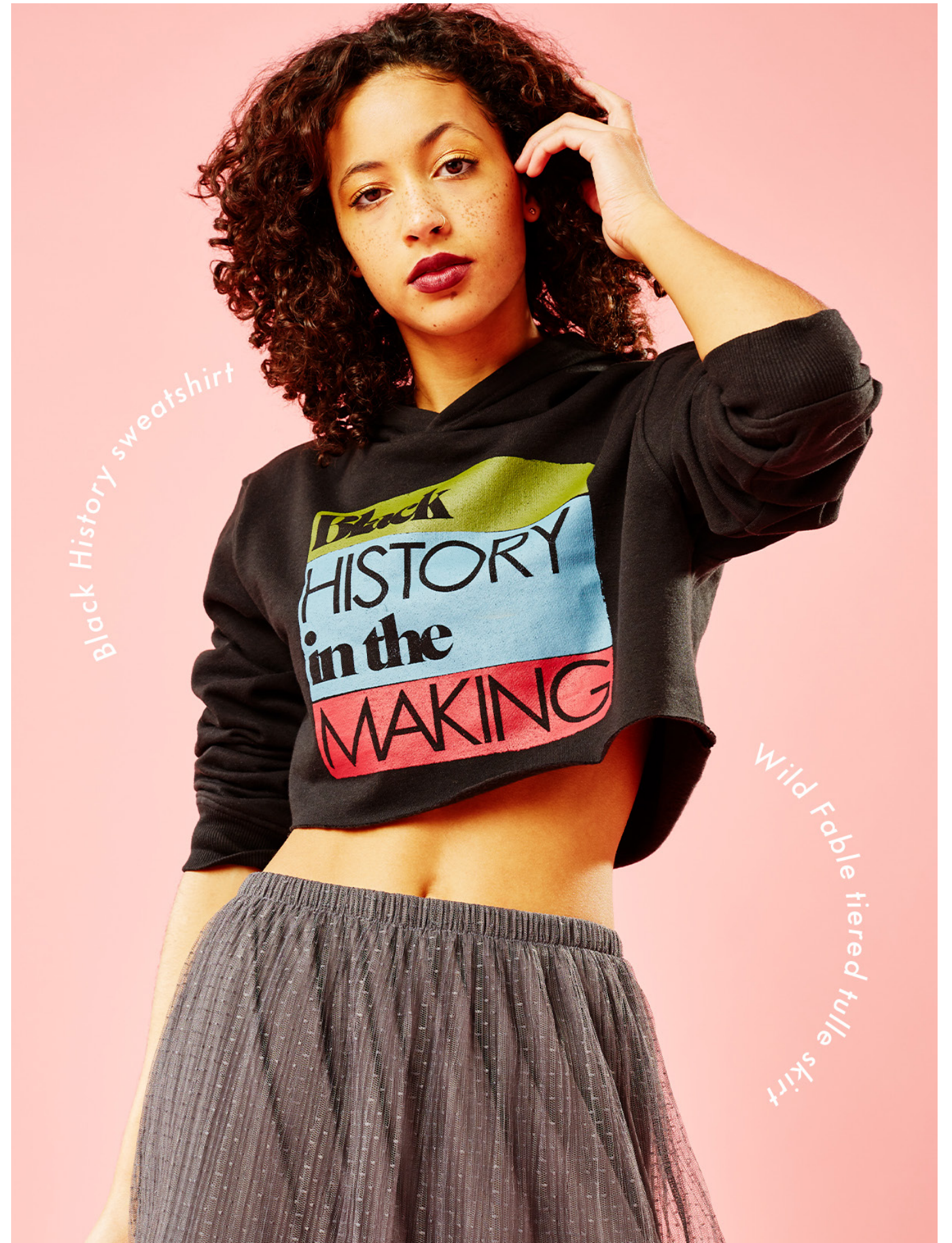
Black History sweatshirt