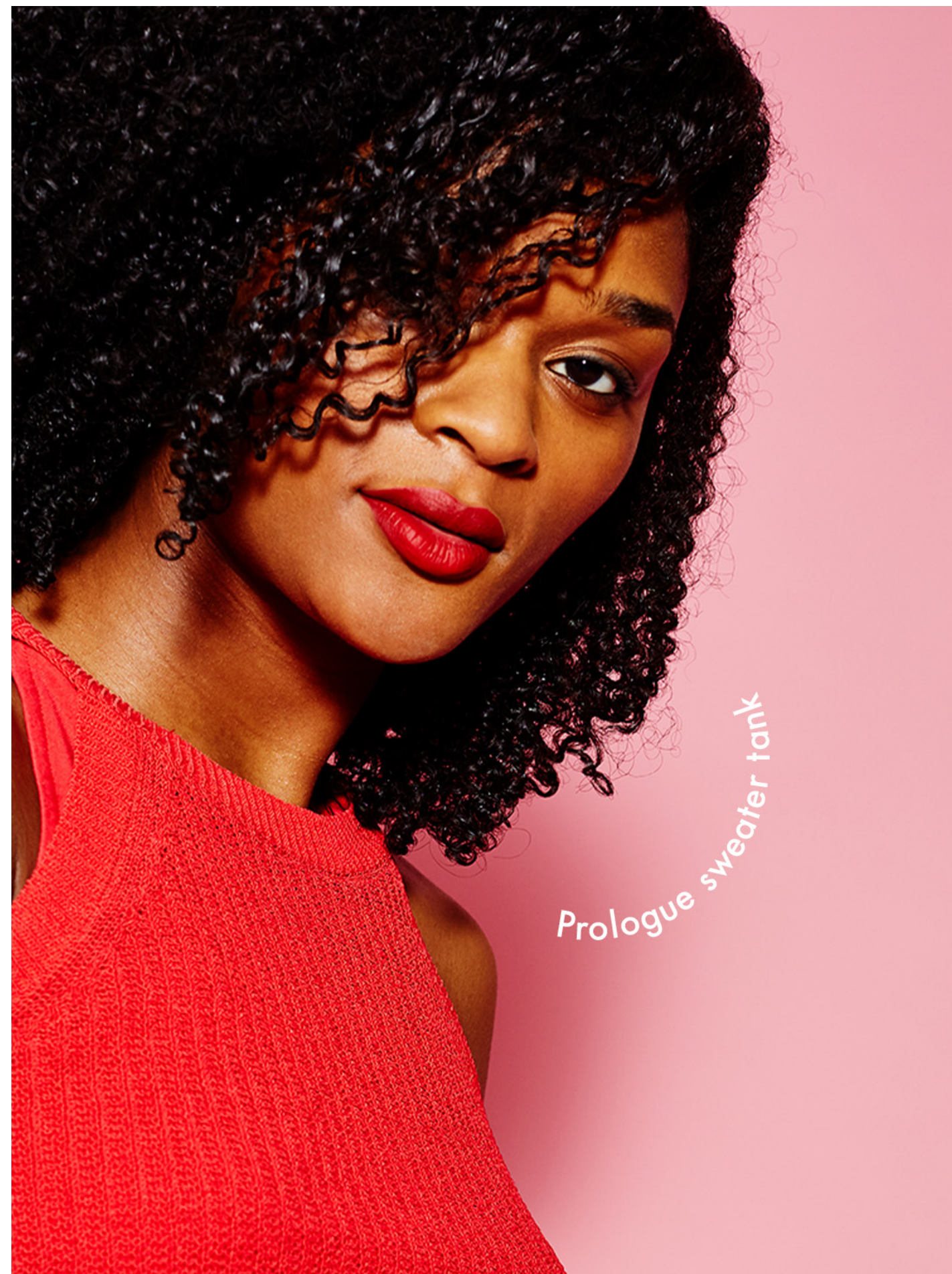
Prologue sweater tank